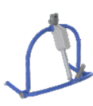
Medium & Large 4-point Powered Dynamic Positioning System