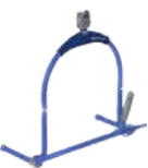
Manual 4-point Dynamic Positioning System